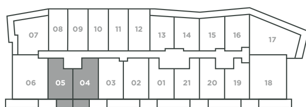
LEVEL 3, 5, 7, 9, 11